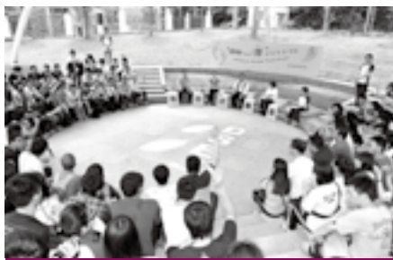
“Like with your legs” hiking and exchange programme