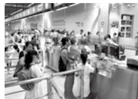
Students-only channel at a border checkpoint