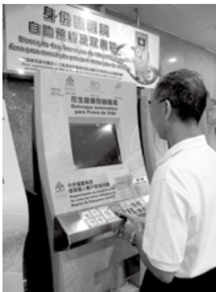
A user-friendly self-service machine designed to provide timely cross-departmental services.