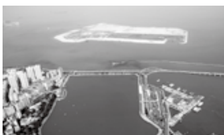
Improving basic infrastructure to build a city suitable for living and tourism